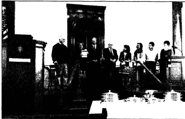
Installation of Search Committee